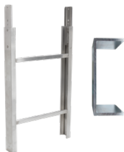
Ladder section 1 m 200 kg Art. No. 03379