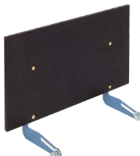
Front protector for general purpose platform Art. No. 02862