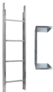
Ladder section 2 m 200 kg Art. No. 03378