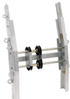
Angle track section Art. No. 02877