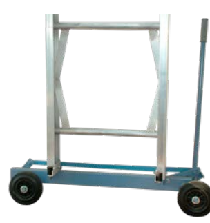
Wheeled undercarriage Art. No. 02822