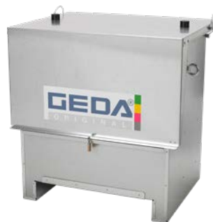
Liftbox Art. No. 46309

For further accessories visit: www.geda.de