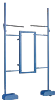
Sheet carrier Art. No. 02831