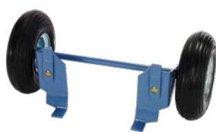
Transport axle Art. No. 02886