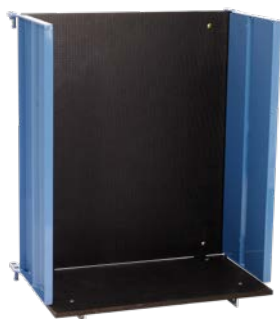
General purpose platform Art. No. 02893