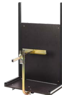
Solar platform Art. No. 02908