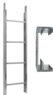
Ladder section 2 m 250 kg Art. No. 02888