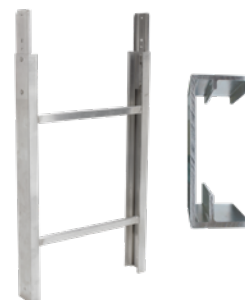
Ladder section 1 m 250 kg Art. No. 02889