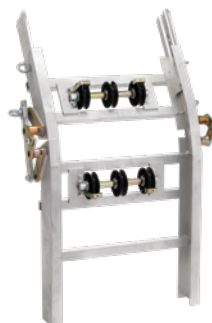
Angle track section Art. No. 02828