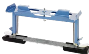
Roof tie Art. No. 02826